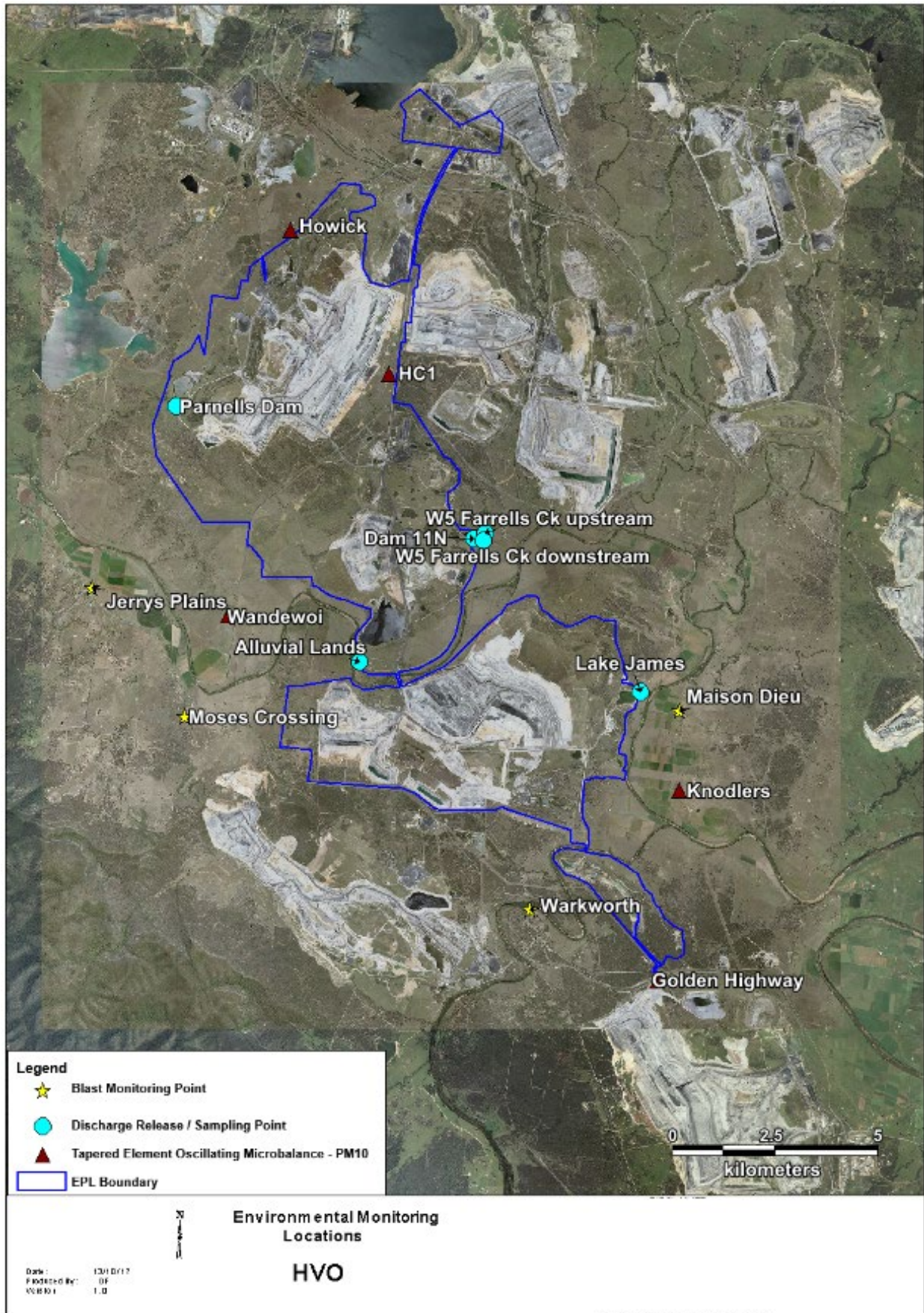
Figure 1 : Hunter Valley Operations Environmental Monitoring Locations