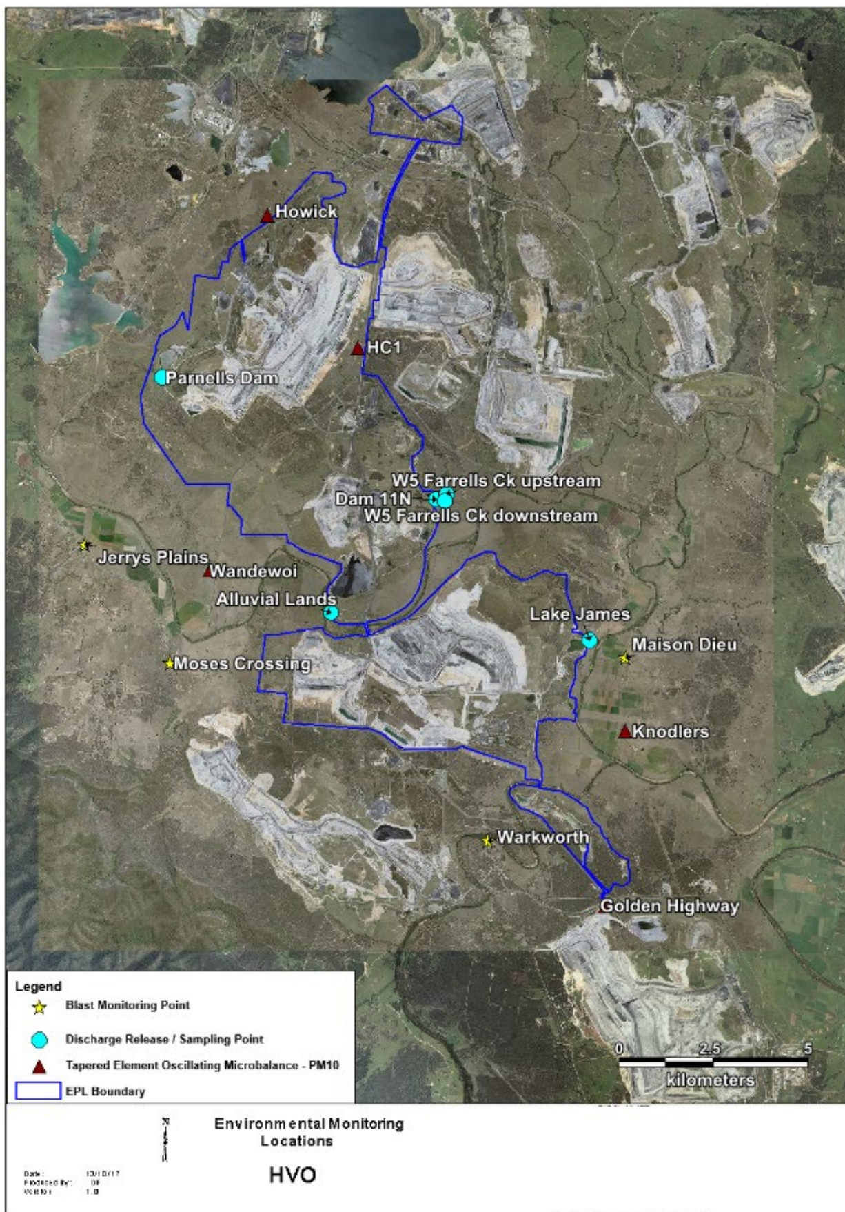
Figure 1 : Hunter Valley Operations Environmental Monitoring Locations