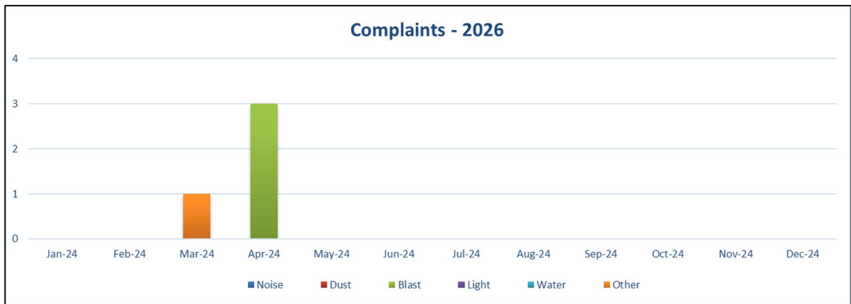
Figure 1: Summary of 2026 Community Complaints by Type

Four (4) community complaints have been received during 2026. A summary of all complaints received during 2026 are provided in Figure 1 and Table 1 .