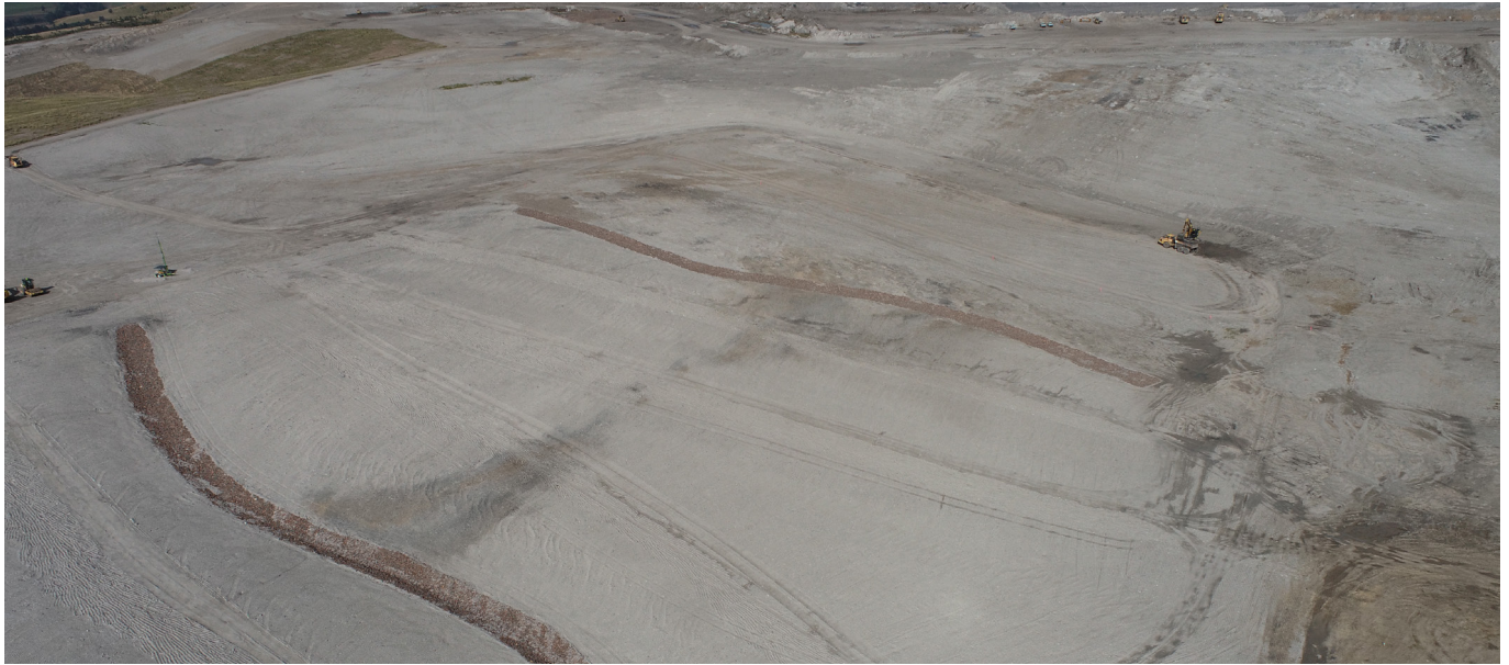
Shaping and rock drain installation at 2025 Cheshunt Rehabilitation

All GMD areas have had an initial weed spray completed, with a follow-up spray and seeding to be completed this Spring.