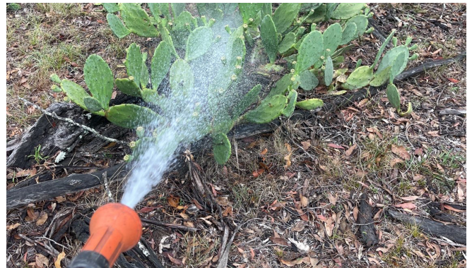
Prickly pear control at the Mitchelhill BOA

All ground-mounted disturbance areas have had an initial weed spray, with follow-up spraying and seeding scheduled for spring.